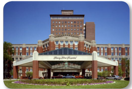
Vattikuti Urology Institute uses ProxSys and UDO technology to give Surgeons unprecedented access to surgery video archives